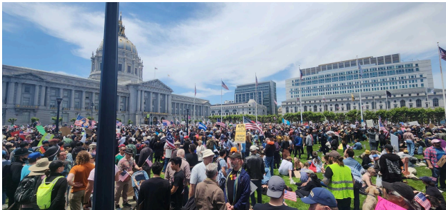
SGWU members attended No Kings Day Protests across the country