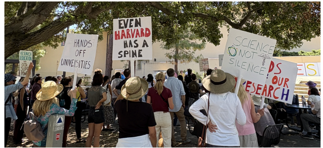
White Plaza rally to protect international students and to defend federal research funding